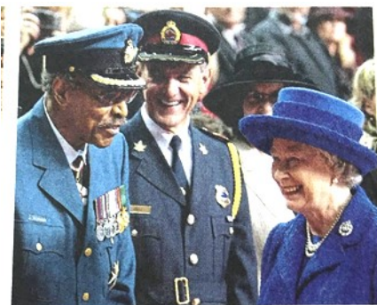
The Queen talks with Lincoln Alexander at a ceremony in Hamilton in 2002.

The photos above were in our local newspaper during the Queen’s visit in 2002.