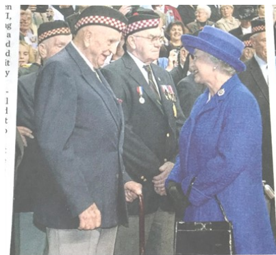
Queen Elizabeth stop to chat with veterans of the Argyll and Sutherland Highlanders in 2002.